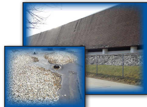
Deteriorated RMS roof and drainage issues with WHS roof